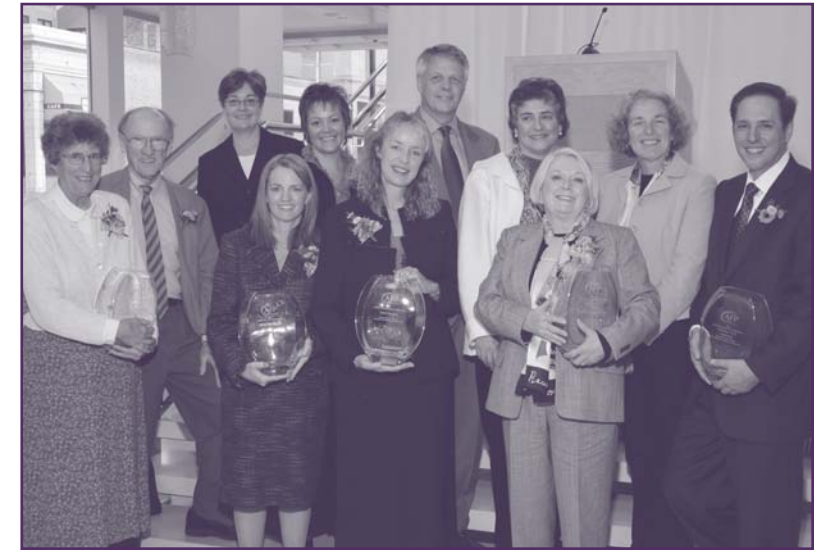
2005 Philanthropy Day Award Recipients and nominators.